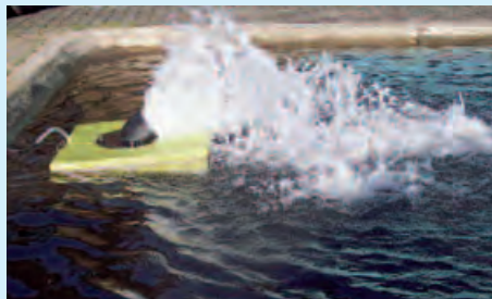
flow deflector for Aqua Hobby with submersible motor

It is possible to fit this to all Aqua-Hobby submersible aerators that have a square float. This deflector is fitted quickly and easily, without tools, and can be removed as quickly.