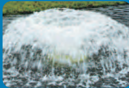
... for aquaculture and fisheries

The motor of this model hangs under the well-proven square float (as used for the Aqua-Hobby). The surface area of the screen (stainless steel screen basket, stan-