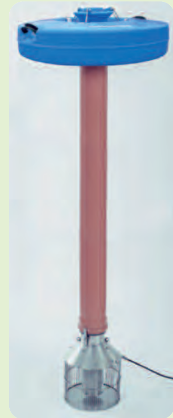
Type II: Deep pump aerator with water deflector

The pump used for this aerator is the same as the Pipe Pump L3 . For technical specification, please refer to the Pipe Pump details on page 23.