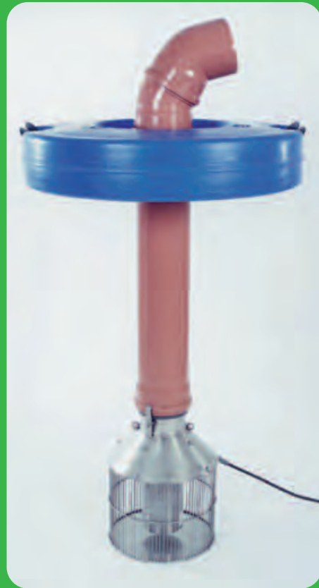
Type I: Deep Pump Aerator with directional water jet. Shown complete with pipe (not included).

... the solution for oxygen enrichment in deeper waters and lakes.