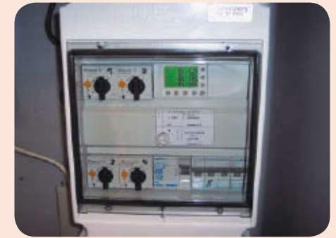
detail PLC module in switch box