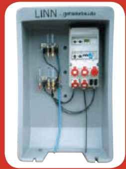
complete unit in protective housing