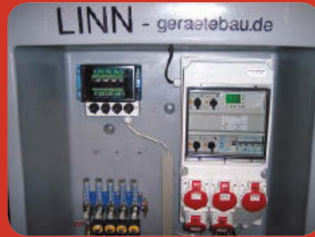
version with transmitters for oxygen probes