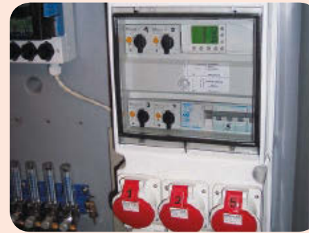
detail switch box

Five sockets are located on the lower half of the switch box: four controlled sockets for plugging in the input systems and another for flexible use. Also included are four sockets for connecting the oxygen probes.