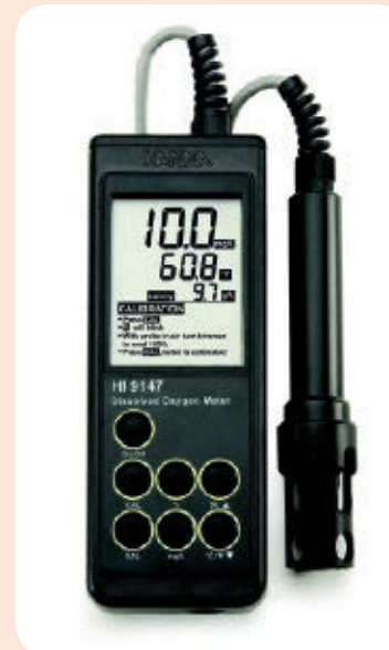
Handy HI 9147

This pH checker offers the capability for fish farmers and hobbyists to determine the pH-value of their ponds quickly and reliably.